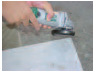
For handling protrusions