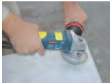
For chamfering or surfacing

Extra-strong grinding power makes it possible to prepare backing smoothly.