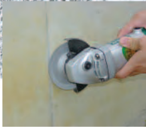
For smoothing uneven concrete surfaces

Extra-strong grinding power makes it possible to prepare backing smoothly.