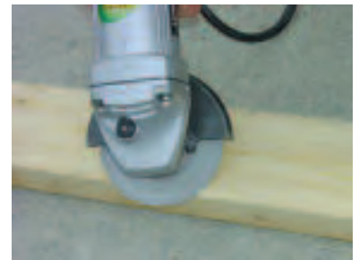
For use on lumber, PVC pipe, and tile too

A sharp and powerful tool for finishing hard-to-grind materials. The unique curved surface makes the work faster and more efficient.