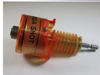
Deflated water tank.

Flip the release lever of the tank. Insert the standard water bottle to the filling port and evacuate the air and the water in the tank completely.